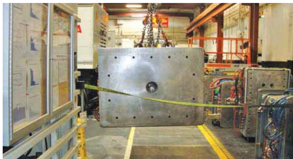
A 20-ton molding case.

Torrance is fortunate to have this varied, multi-diverse manufacturing company right smack dab in the heart of our city. Our children benefit from its presence as an example of how a huge manufacturing company can thrive in a city as balanced as Torrance. One thing I found really amazing is the "footprint" it leaves is tiny. The company fills one dumpster in one month! Our city is balanced and that in part is due to the manufacturing company of Pelican Products, Inc. •