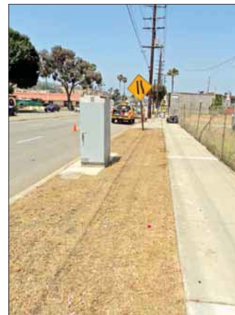
Before and after. The Mattucci Project cleaned up a section of Pacific Coast Highway in Torrance on May 4th.