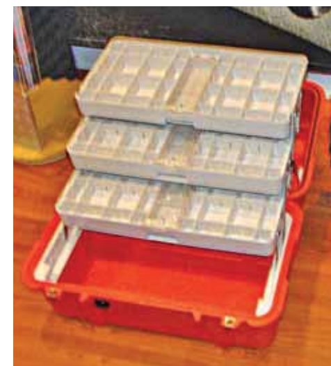
Cases used for medicines.

Before I took a tour of the plant that makes everything from temperature-controlled cases that hold medicines to covers for your iPhone and smartphone, I asked Lyndon to reveal