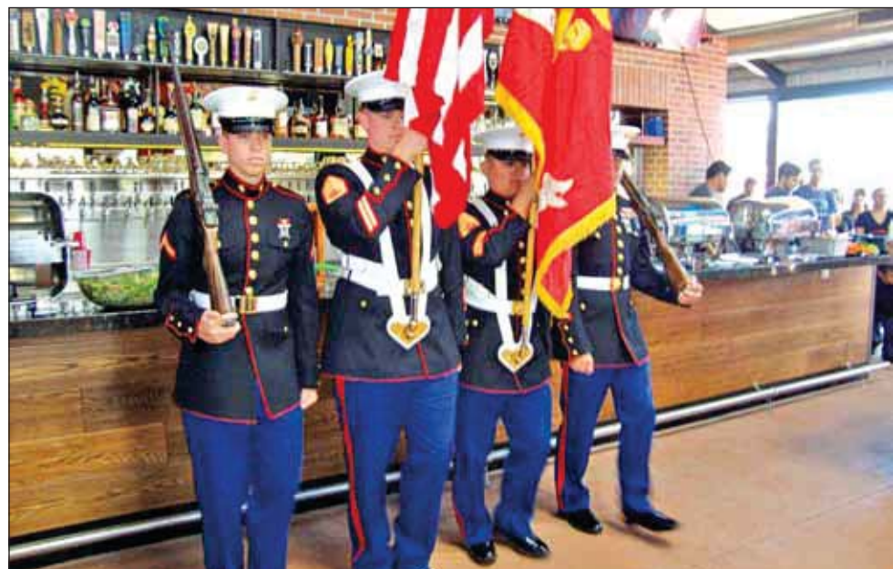
Color Guard present colors.

capacity or another. Any chance we have a chance to highlight what these people do for us is the least we can do. They served us--we owe them everything. We take for granted this freedom we have here. These people