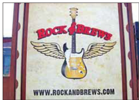
Opening of Torrance's Rock & Brews PCH.