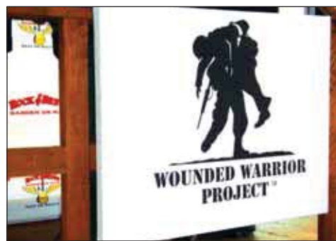
Wounded Warrior Project Honored.

Hendrix's National Anthem after the colors were brought in by four Marines, I asked Gene Simmons and Paul Stanley about their feelings about our veterans. Paul said, "On previous KISS tours we gave $1 from every ticket to the Wounded Warrior Camp Project, which is an organization that works to rehabilitate these great men and women when they fight overseas, and their families. To help them get through the ongoing trauma. So we have always been involved with wounded warriors in one