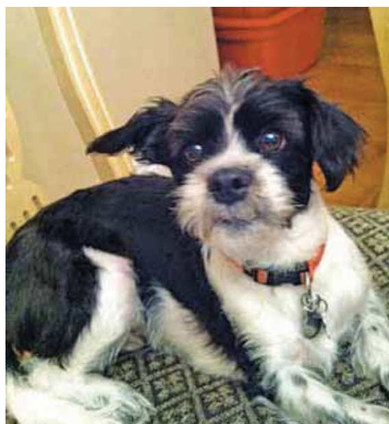
Raider, the best dog ever!