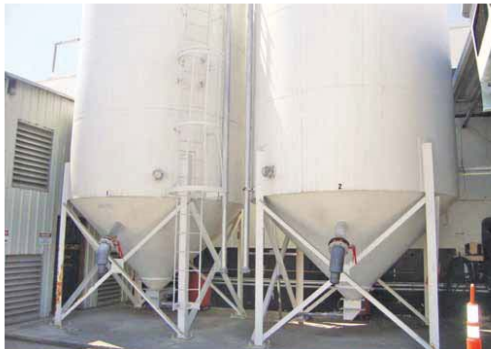
Silos where plastic pellets are stored until formed into case.