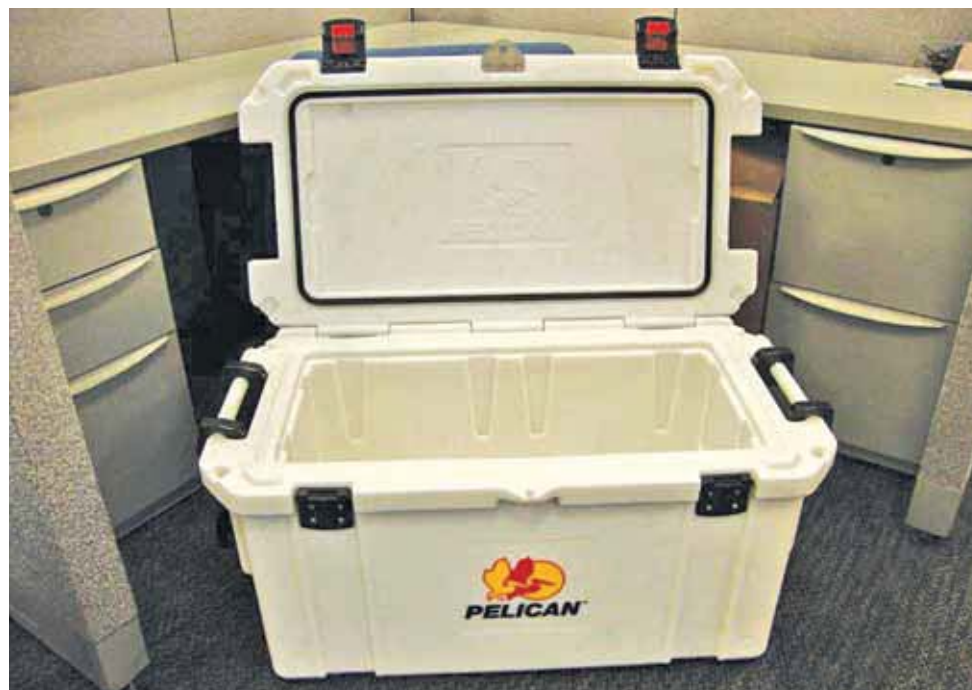
Large temperature controlled case - will keep ice 7 - 10 days.