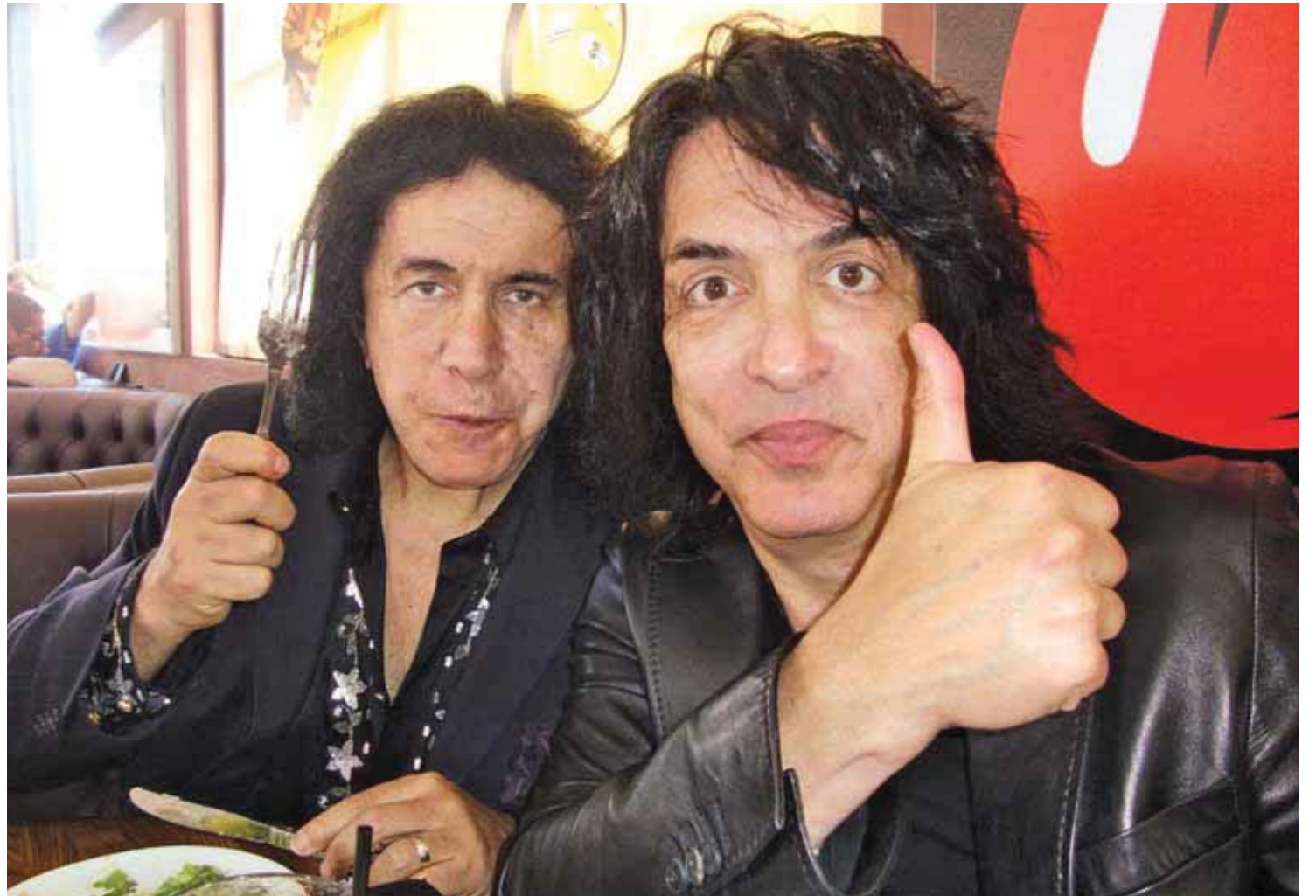
Gene Simmons and Paul Stanley, of iconic rock band KISS, were on hand at the Grand Opening of Rock & Brews in Torrance, where they served 100 military veterans. KISS co-owns the Rock & Brews franchise, which has plans to grow internationally. Go to page two for more photos.